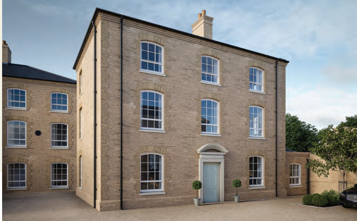
B2 & B3 – Two bedroom apartments