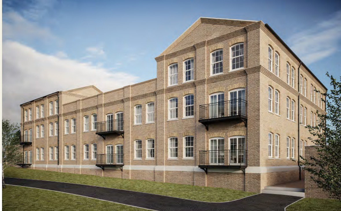
D3 and D6 – Three bedroom apartments